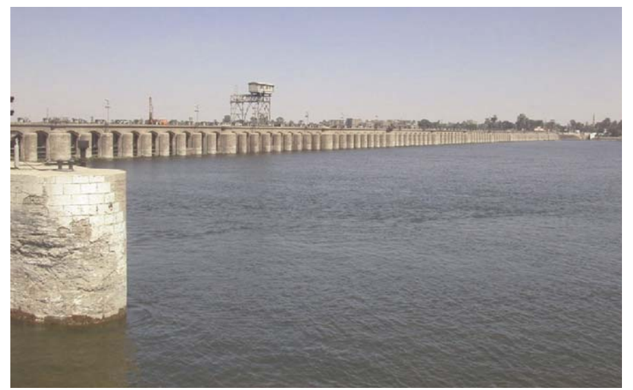
Figure 1: Assiut Barrage, View from Upstream

Figure 1 shows a general view of the barrage as it stands today.